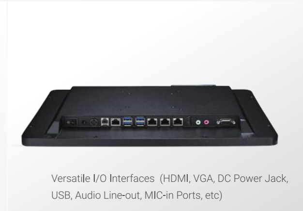
Versatile I/O Interfaces (HDMI, VGA, DC Power Jack, USB, Audio Line-out, MIC-in Ports, etc)