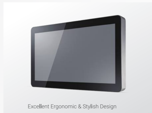
Excellent Ergonomic & Stylish Design