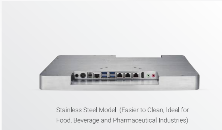
Stainless Steel Model (Easier to Clean, Ideal for Food, Beverage and Pharmaceutical Industries)