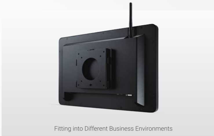
Fitting into Different Business Environments