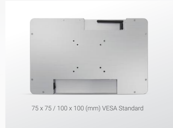
75 x 75 / 100 x 100 (mm) VESA Standard