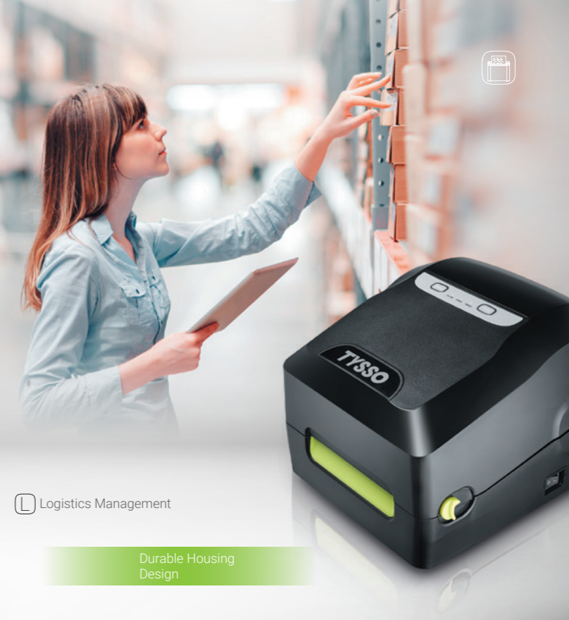
Durable Housing Design