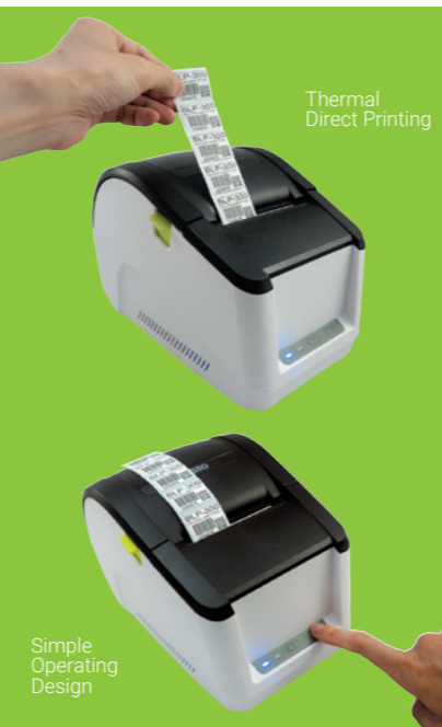
Thermal Direct Printing