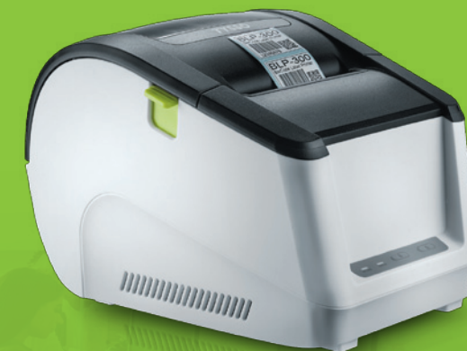
Thermal Direct Printing