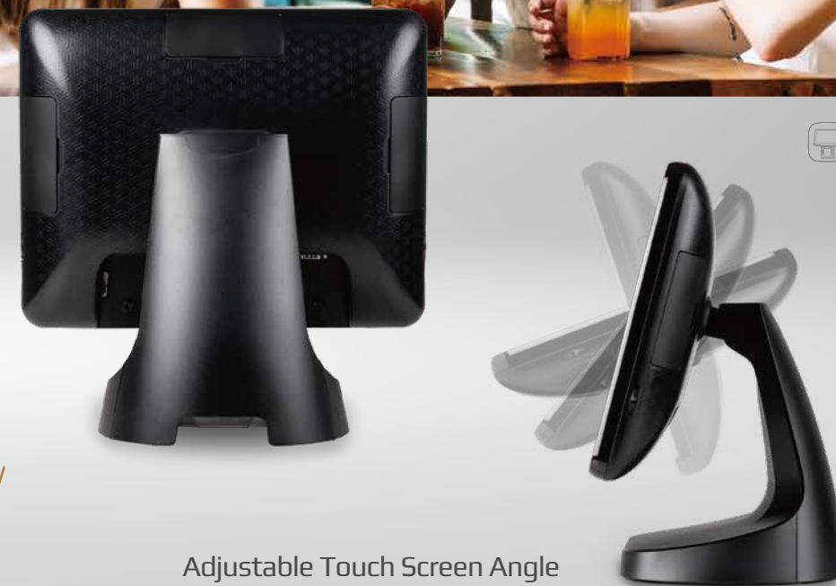
Adjustable Touch Screen Angle