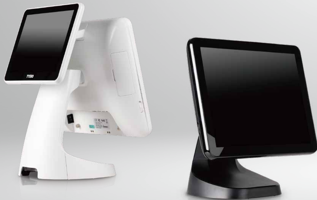
Black and White Color Options

15-INCH FANLESS INTEL HIGH PERFORMERCE POS SYSTEM