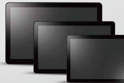
15", 15.6", 21.5" Sizes Available