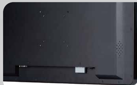
VESA-Compatible Design for Easier Installation