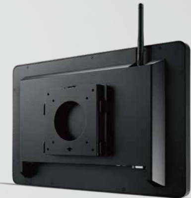
Fitting into Different Business Environments