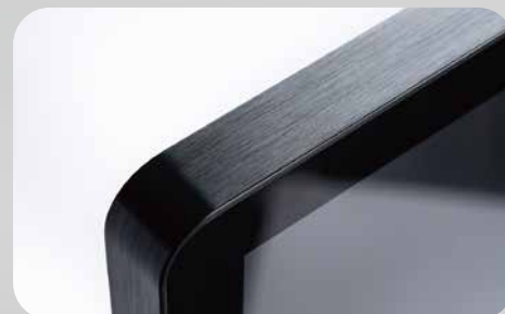
Brushed Metal Display Bezel