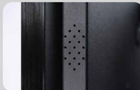
Built-in High-Quality Speaker on the Side