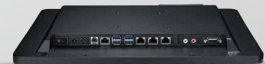
Versatile I/O Interfaces (HDMI, VGA, DC Power Jack, USB, Audio Line-out, MIC-in Ports, etc)