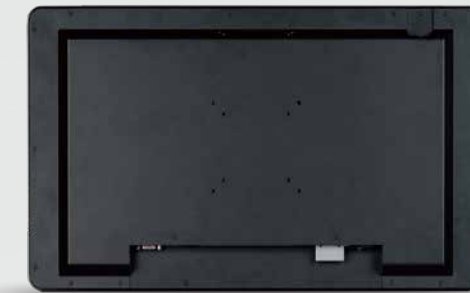
75 x 75 / 100 x 100 (mm) VESA Standard