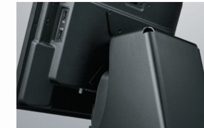
Durable alloy space-saving base, ideal for situation where space is at a premium