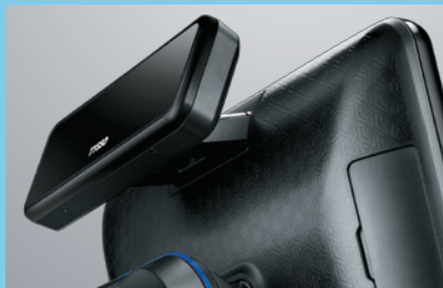
Convenient to install and replace modular peripherals