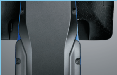
Curves on both front and back, distinctive and attractive look